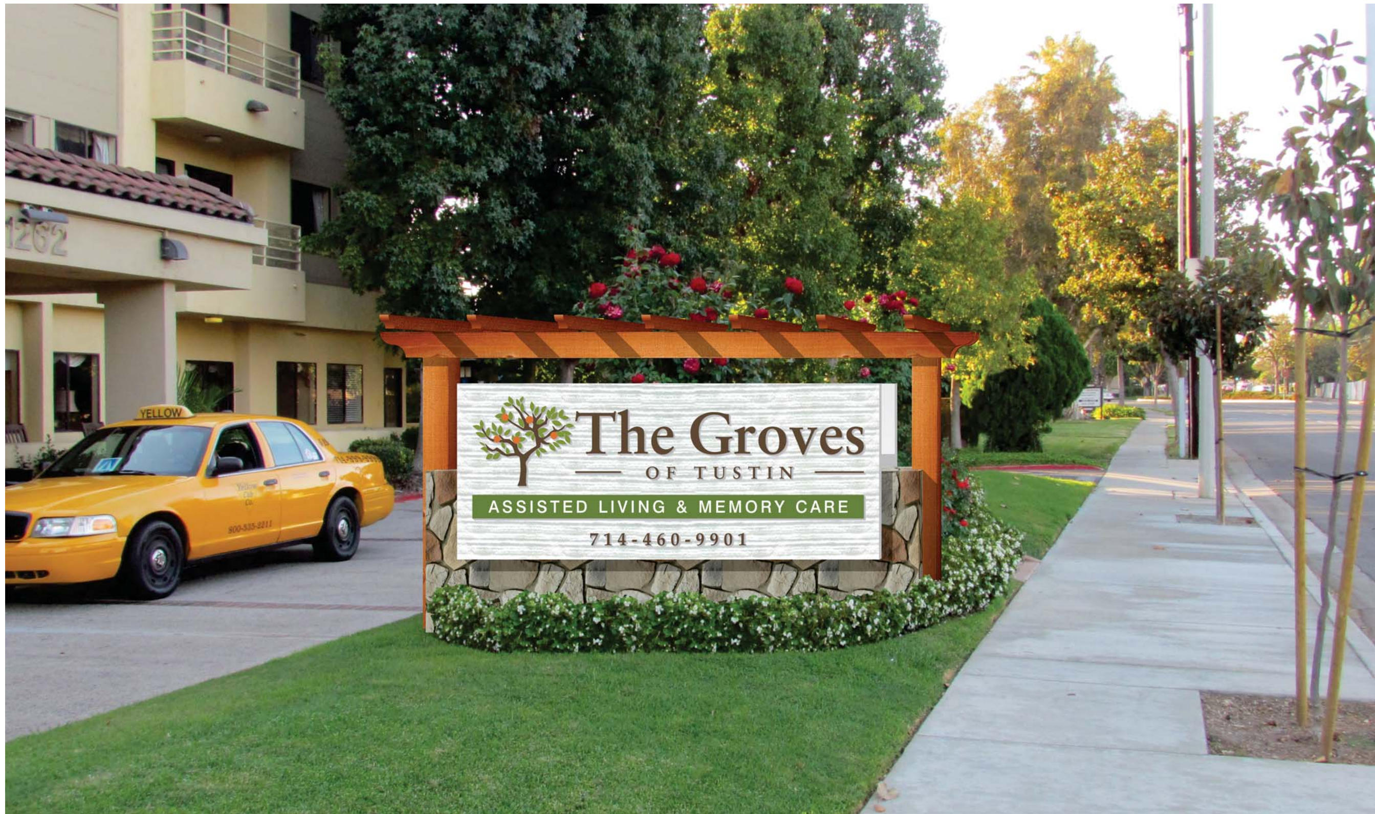
New Double-Face Monument Sign